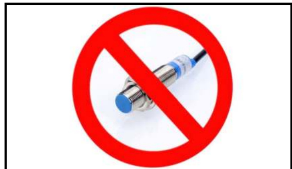
Prohibited Proximity Sensor Switch