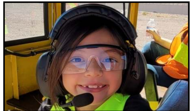
Proper Eye Protection