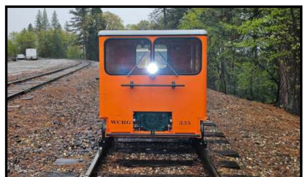
CORRECT OPERATING PRACTICE: Headlight Properly Displayed

When in doubt, STOP the movement, PROTECT following movements, NOTIFY the Employee in Charge