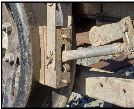
"Missing Brake Shoe Nuts"

The proper maintenance, adjustment, and inspection of your track car's brake system is essential for the safe operation of a track car on WCRG excursions. Excursion participant's track cars must not have any brake defects while operating. Brakes must be properly adjusted, including holding in the first notch. Defective conditions such as loose or missing brake shoe bolts/nuts, improper toggle arm retention hardware, including missing cotter keys, hairpin clips, hitch pins, or other quick release fasteners used in place of cotter pins, as well as jam nuts not tight on the brake arms must be corrected before track car is operated. If defects are found at anytime during an excursion, notify the Employee in Charge at once for any possible movement restrictions.