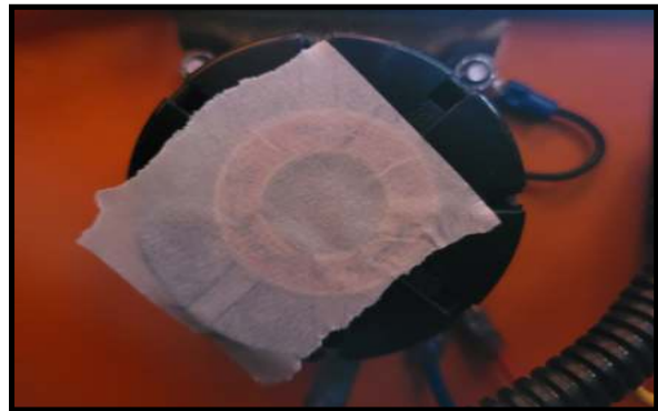
“Taped Over Turntable Alarm”