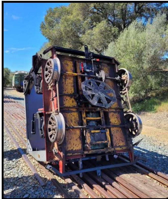
Photo: Result of Actual Recent Turntable Failure

As a result of the dangers of turntables dropping from the fully raised and locked position, WCRG has implemented additional turntable safety requirements. These requirements include a visual warning light and an ignition interlock to immediately shut down the engine in the event a turntable becomes out of correspondence/not fully retracted. Additionally, audible alarms, visual lights, and ignition interlocks must be wired to a constant hot electrical source. Operating practices changes, including a second person visually inspecting the turntable each time it is operated to verify it is fully retracted, locked and safe to proceed will also be required. These steps will reduce turntable failures and prevent accidents.