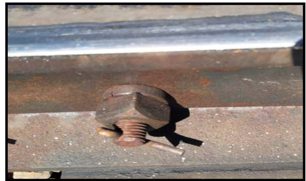
Metal Grindings at Base of Rail