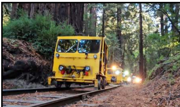
INCORRECT OPERATING PRACTICE: Headlight Not Displayed