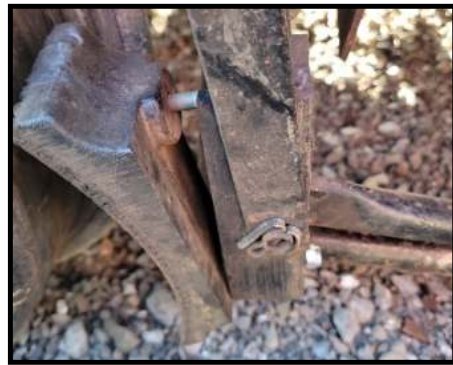
"Brake Shoe Bolts Loose/ Shoe Separated from Wood Block"