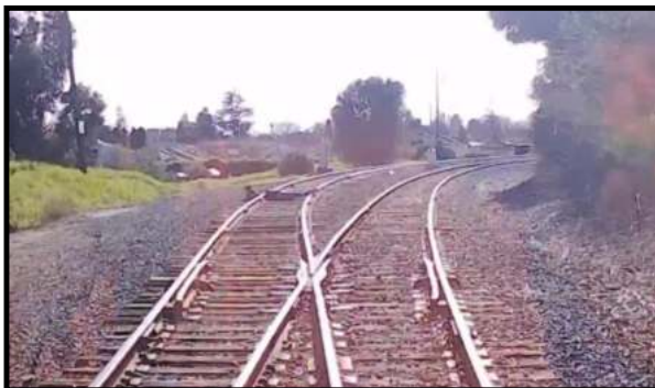
Trespasser Laying Between The Rails