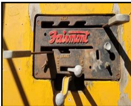
"Brake Handle Not Adjusted to First Notch"