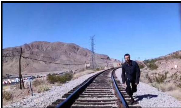
Trespasser Fouling The Track

Below are actual images of incidents captured on WCRG excursions.