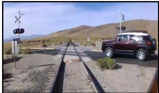
Vehicle Driving Around Activated Automatic Crossing Warning Devices