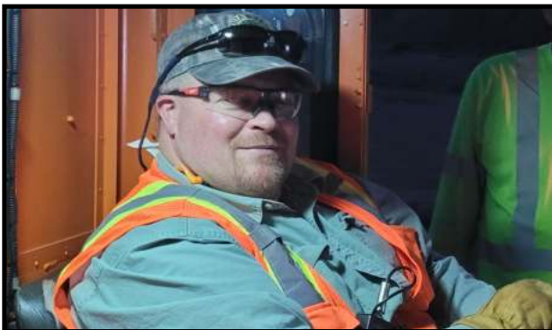
Proper Eye Protection