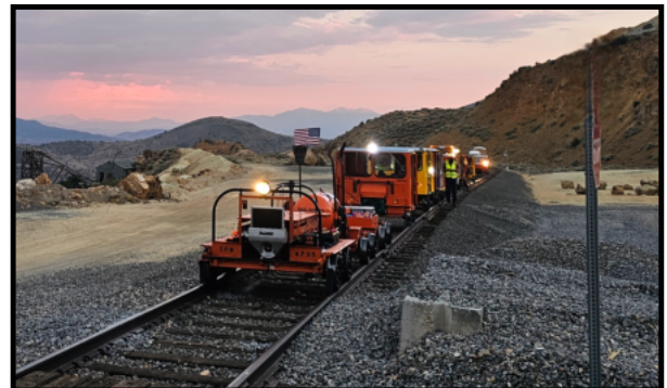
CORRECT OPERATING PRACTICE: Headlight Properly Displayed