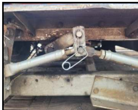
"Improper Toggle Arm Hardware/ Loose Adjusting Nut"