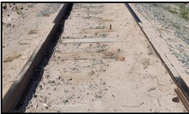
Sand On Top of Rail

Below are examples of eye hazards as well as proper use of eye protection on WCRG excursions.