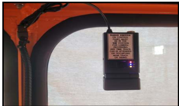
Outward Facing Camera Installed