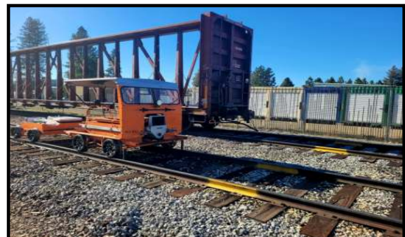
CORRECT OPERATING PRACTICE: Track Car and Railcar Clear of Yellow Painted Clearance Point.