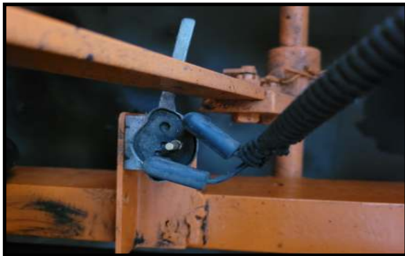
“Disabled Brake Light Switch”

Track car mounted safety devices that become defective or fail en route are not considered purposeful or willful disabling, when the EIC (Employee in Charge) is immediately notified of the failure or defect and proper safeguards are put in place before initiating or resuming movement. Any excursion participant found to have purposely or willfully disabled a track car mounted safety device may be barred from future WCRG excursions.