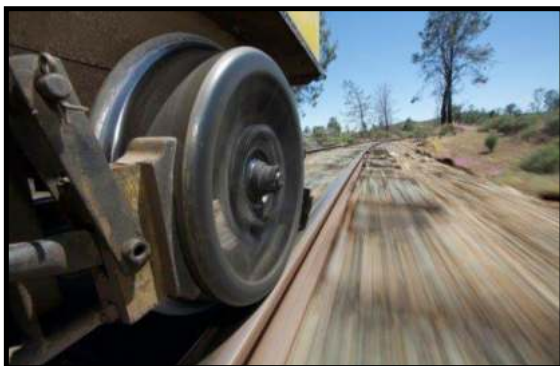
No filming on a moving track car.