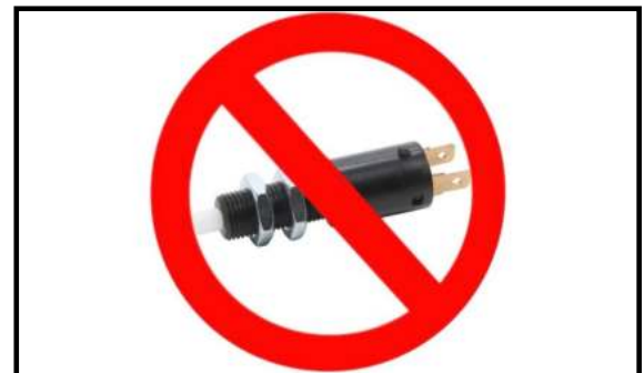
Prohibited Push Button Switch