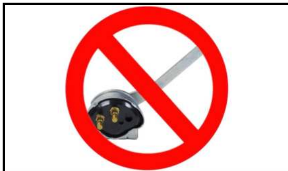
Prohibited Lever Switch