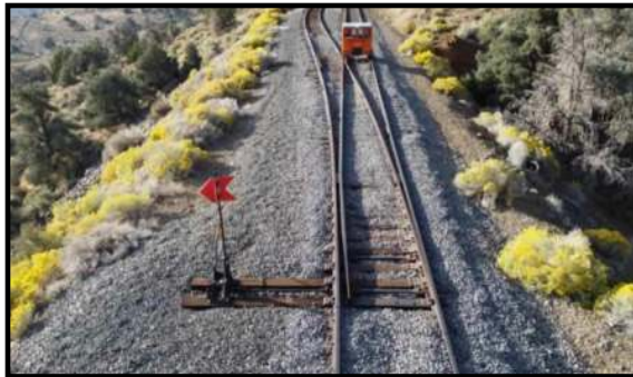
INCORRECT OPERATING PRACTICE: Switch Lined for Adjacent Track, Track Car Fouling Adjacent Track.

Refer to WCRG Track Car Excursion Operating Rules & Standards "Operating over Switches and Frogs" for further clarification.