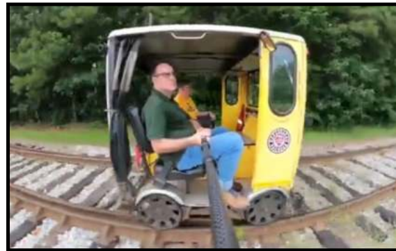
No selfie sticks on moving track cars.