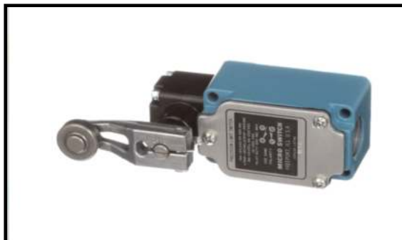
Required Honeywell 1LS1 Precision Roller Lever Limit Switch

Below are examples of required/prohibited turntable switches for use on WCRG excursions.