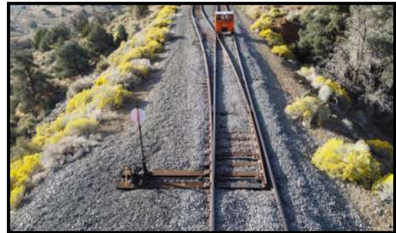
CORRECT OPERATING PRACTICE: Switch Lined for Track that Track Car is Occupying.