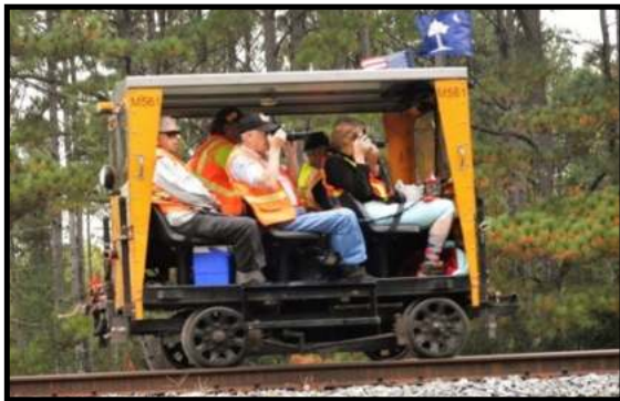
No photography on moving track cars.

Below are examples of unacceptable Electronic Device Distractions.