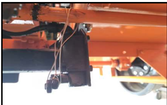
“Disabled Turntable Switch”