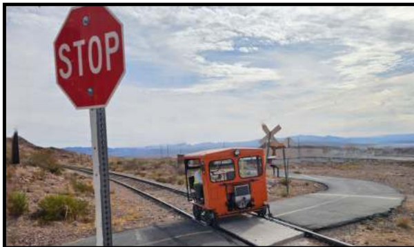
INCORRECT OPERATING PRACTICE: Headlight Not Displayed

Refer to WCRG Rule "Headlight and Markers" and "Track Car Daily Inspection and Defect Reporting Requirements" for further clarification.