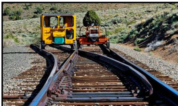
INCORRECT OPERATING PRACTICE: Switch Lined for Orange Track Car, Yellow Track Car Fouling Adjacent Track.